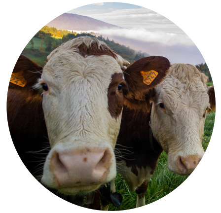
Two of the major causes of losses in beef suckler farming are calf scour and pneumonia.

There are a vast array of vaccines now available for cattle. It isn't possible, in this article, to cover all the different types of farm animal vaccines and schedules. Each farm has different risk factors and aims of production. To make sure your herd is protected, it is useful to discuss with your vet what the risk factors are on your farm, what vaccines are available and how best to implement a disease prevention program for your herd.