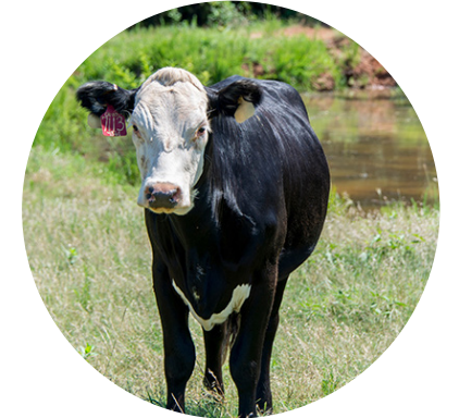
females is vital to maximise success and reduce the time between services.