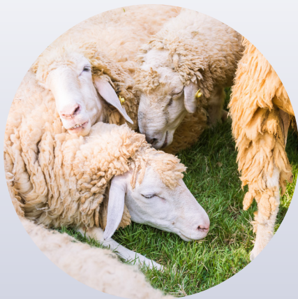
OPA is commonly introduced into new flocks through the purchase of new animals.

If you have any questions or have concerns that you may have OPA in your flock, give us a call.