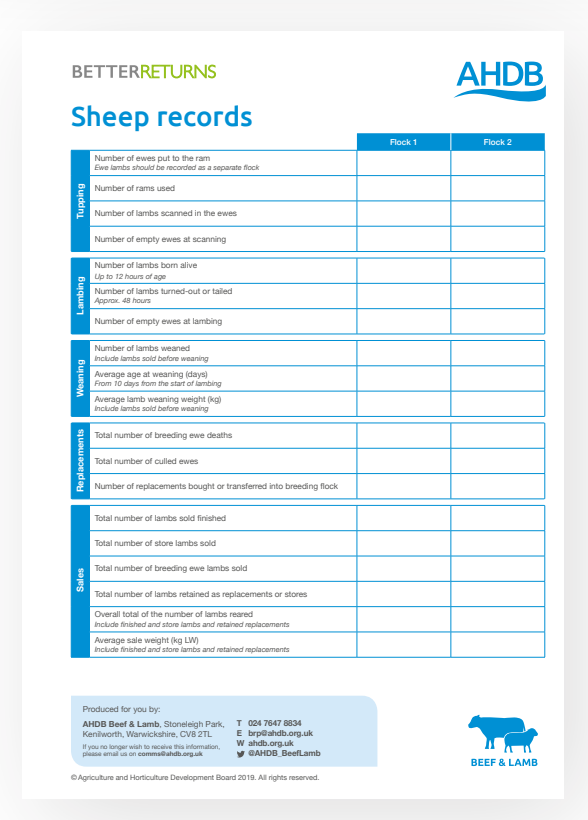
Sheep Records for Better Returns

Give us a ring and we will be more than happy to arrange a time to look over your KPIs with you and discuss how they can be used to improve your farm performance.