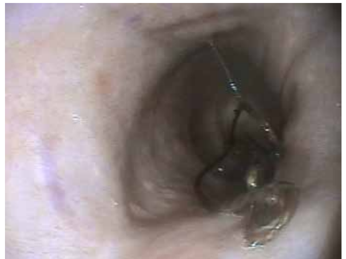
Left & Right: Removal of a fishing hook via gastrotomy