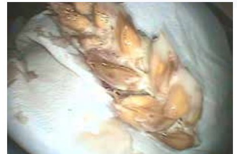
Above: Corn lodged in right main stem bronchus