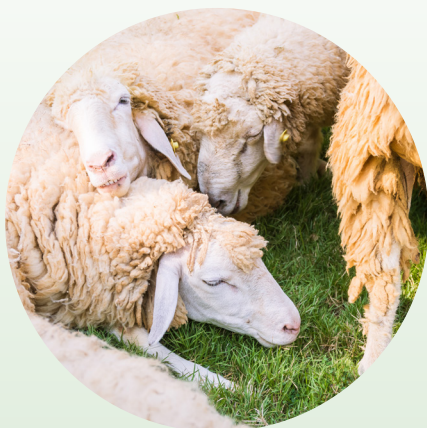
OPA is commonly introduced into new flocks through the purchase of new animals.

If you have any questions or have concerns that you may have OPA in your flock, give us a call.