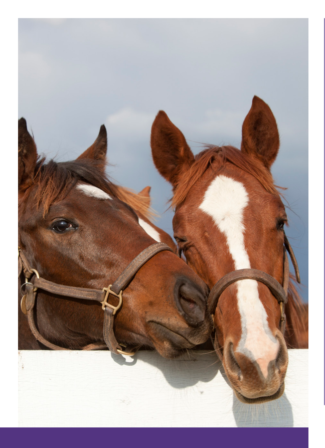
Mud fever affects all horses and ponies, but is more prevalent in the feathered breeds.