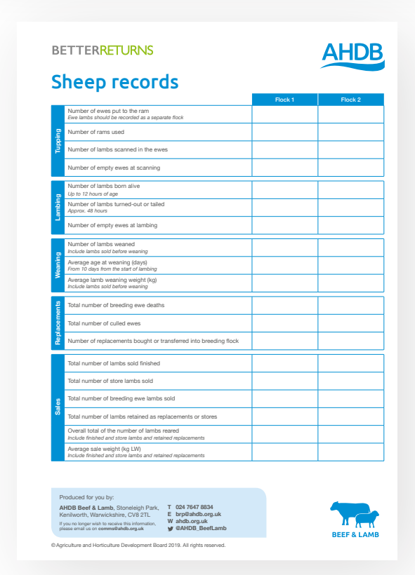
Sheep Records for Better Returns

Give us a ring and we will be more than happy to arrange a time to look over your KPIs with you and discuss how they can be used to improve your farm performance.