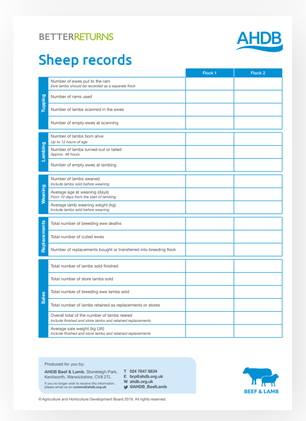
Sheep Records for Better Returns

Give us a ring and we will be more than happy to arrange a time to look over your KPIs with you and discuss how they can be used to improve your farm performance.