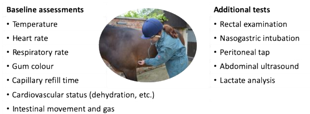
Figure 2. Veterinary assessments in cases of colic

2. The vet will examine the horse, making the assessments shown in Figure 2.