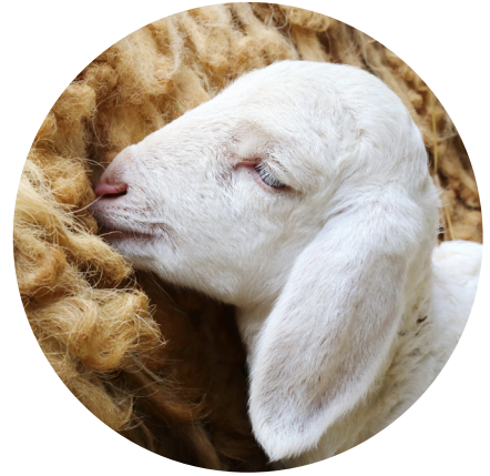
The virus may also be spread from ewe to lamb through milk or colostrum.

In affected flocks, OPA can be the cause of death of 1% to 20% of the flock in one year. Additional productivity losses such as reduced fertility have yet to be investigated. It is important to note here, that the early stages of OPA are not always apparent as the tumours are too small to cause any breathing problems, even though they are able to produce virus which can infect other sheep.