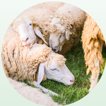
OPA is commonly introduced into new flocks through the purchase of new animals.

If you have any questions or have concerns that you may have OPA in your flock, give us a call.