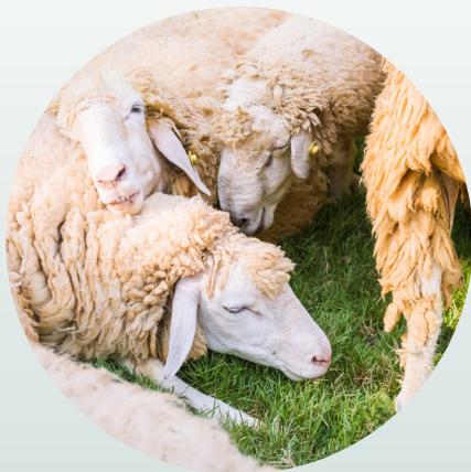
OPA is commonly introduced into new flocks through the purchase of new animals.

If you have any questions or have concerns that you may have OPA in your flock, give us a call.