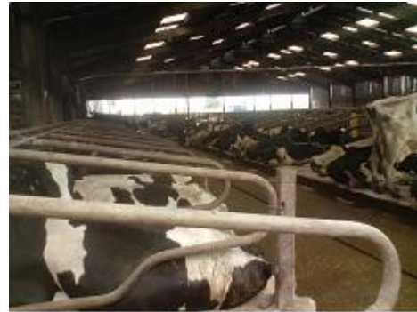
Fig 2: On this farm there were two cows stood in the cubicles for every twenty-two lying down. Cubicle Standing Index = 9%

To be most representative, CSI should be measured two hours before milking, at which time the index should be less than 20%, and the best herds consistently achieve less than 10%. (Fig 2) However, the index is most useful for monitoring the impact of improvements over time.