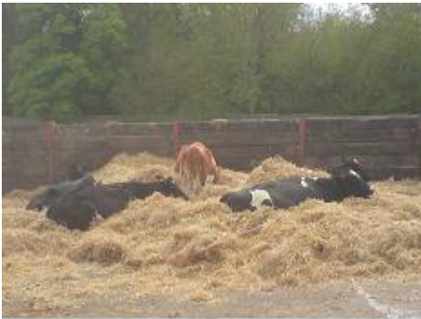
Fig 1: Cow comfort is important for cow longevity and productivity

Whilst at first sight comfort issues such as hock damage may appear to affect small numbers of animals within the herd, animals that fail to cope reflect the 'tip of the iceberg', with the rest of the herd coping but at a hidden cost. Crucially, when it comes to cow comfort the most vulnerable animals tend to be the heifers (the future of the herd) and the lame, which often 'get lame and stay lame'.