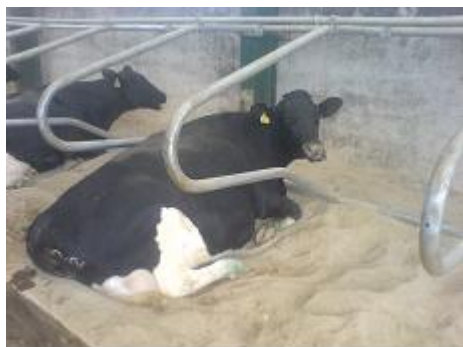
Fig 4: The supercomfort design offers borrowing space, forward lunge space, bob space and side lunge space

(4) Cubicle length and lunge space. Typical Holstein-Friesian requires 1.7m bed length and a further 1m of forward lunge space. A cubicle divider design that allows side lunge space will help cows if a cow is occupying a cubicle directly in front of her.