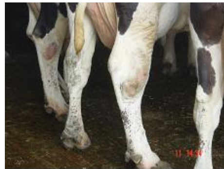
Fig 3: Hock swelling and hairloss indicates hard beds and abrasive bedding.

Observing and examining the cows in the cubicles is the only way to identify comfort problems. Cubicles should be designed to provide comfort for the largest cows in the herd, not the average cows. Lying position should be determined by a brisket board, that rises no more than 10cm above the bedding. Even with this, some dung on 10% of cubicles must be expected and will do little harm if regularly cleaned off.