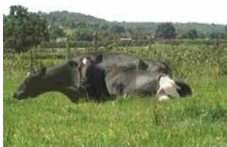
Fig 5: A cow requires approximately 1m of forward lunge space, and bobs the muzzle to the ground on rising, to create a counter balance for the rear quarters. Without this, more force goes through the hock

The following interventions appear to be extremely cost-effective: