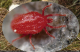
A highly magnified mite. They are actually smaller than 1mm.

Treatment and Prevention Products are available to deal with harvest mites and our vet will provide instructions for treating and helping to prevent or reduce reinfestation. During the season regularly check around the ears, face, under the chin, the mouth and areas of the body that have no or very little hair. If you see your pet excessively scratching and nibbling or notice clusters of tiny orange/red flecks on the skin, call us for further advice. There are many conditions that can cause skin irritation, so it is always best for your pet to be checked over.