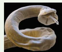
Electron micrograph of an adult lungworm

Once swallowed, the larvae migrate to the heart where they will develop into adult