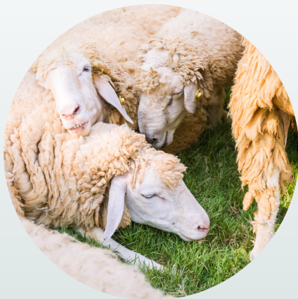
OPA is commonly introduced into new flocks through the purchase of new animals.

If you have any questions or have concerns that you may have OPA in your flock, give us a call.