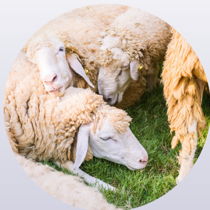
OPA is commonly introduced into new flocks through the purchase of new animals.

If you have any questions or have concerns that you may have OPA in your flock, give us a call.