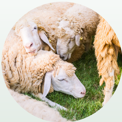
OPA is commonly introduced into new flocks through the purchase of new animals.

If you have any questions or have concerns that you may have OPA in your flock, give us a call.