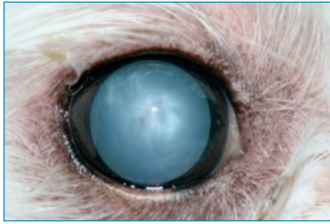
Before cataract surgery