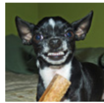
An angry dog (growling)

Good dog body language is relaxed and wiggly. Stiffening and freezing, cowering with ears back and tail under means your dog is not comfortable with the situation.