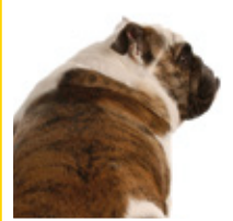
An unsure dog (avoidance)