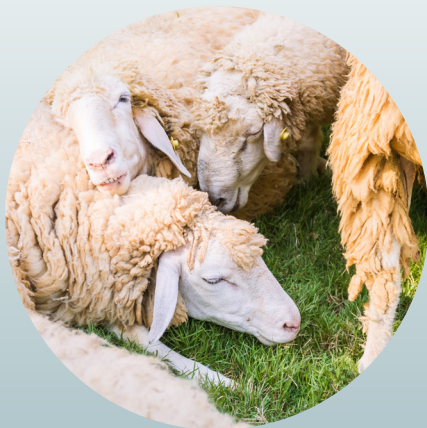
OPA is commonly introduced into new flocks through the purchase of new animals.

If you have any questions or have concerns that you may have OPA in your flock, give us a call.