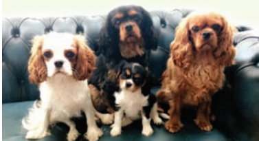
FOUR OF OUR OSWALD'S HEALTH PLAN MEMBERS Oliver (Blenheim) • Judy (black tan) • Kiki (ruby) • Edie (tri)

Please see our leaflets at reception or call for further information: 01902 731127