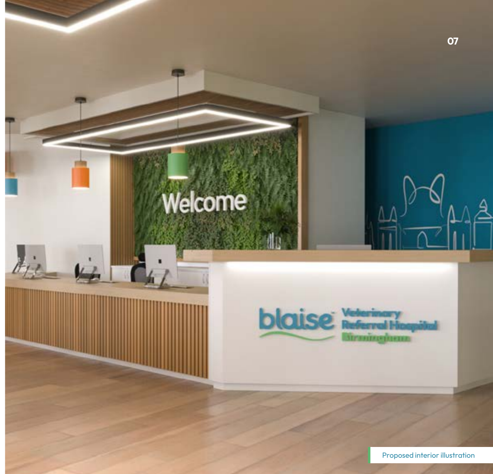
Proposed interior illustration