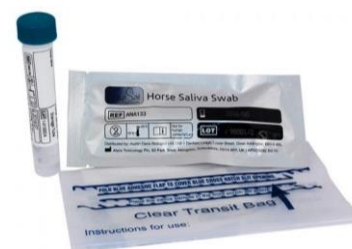
Equisal test kit

Equisal tapeworm kits can be picked up from the practice and are used to collect a saliva sample. This test is suitable for any horse of post weaning age and provides valuable information about the tapeworm status of your horse. Of the horses we have tested so far in 2021, more than 90% had a low tapeworm burden and so did not require treatment. Historically, we have always treated every horse for tapeworm every year and whilst we still want to treat those which need it, this data shows blanket treatment will result in significant overtreatment. Therefore, tapeworm treatment should ideally follow a positive test result.