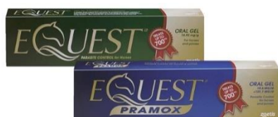
Wormer containing moxidectin

We have now updated and emailed out our 2021/22 worming programme to those of our clients signed up to the mailing list. This is a free of charge service which outlines a suggested schedule for the timing of worm egg counts and strategic winter worming, starting from this December.