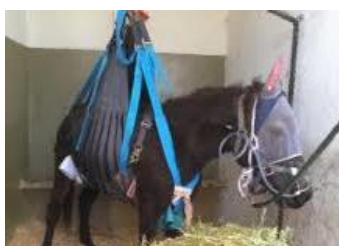
Horse being treated for tetanus.

It is therefore really important that if you are intending to compete your horse, you know exactly under which rules you will be competing. Any lapse in the vaccination timing, even by just a few days, requires that the horse re-starts the full course of flu vaccines. Although we endeavour to send out vaccination reminders, we do not know under what rules you will be competing and it is ultimately your responsibility to ensure your horse's vaccines comply with the competition rules.