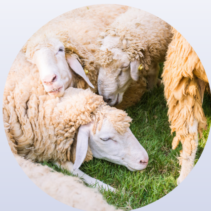
OPA is commonly introduced into new flocks through the purchase of new animals.

If you have any questions or have concerns that you may have OPA in your flock, give us a call.