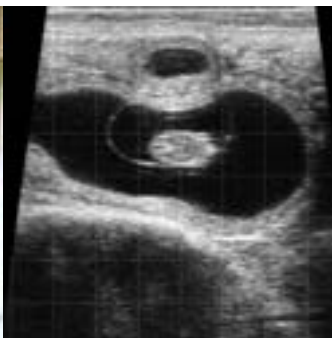
This is what we see around 33 days in calf