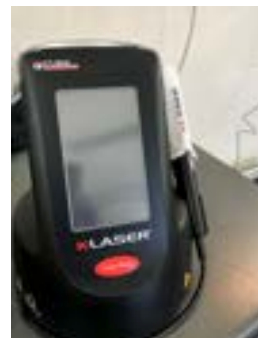
K-Laser therapy - a recent addition