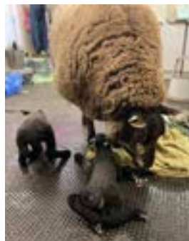
After a successful caesarian at the clinic