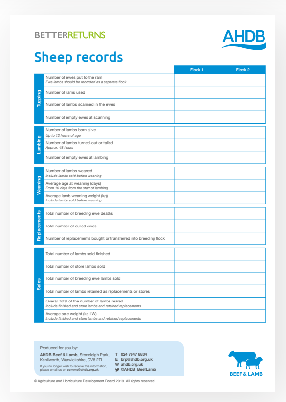
Sheep Records for Better Returns

Give us a ring and we will be more than happy to arrange a time to look over your KPIs with you and discuss how they can be used to improve your farm performance.