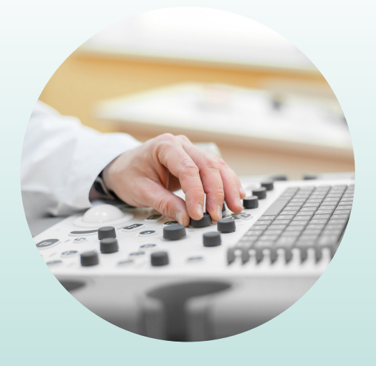
Ultrasound scanning of the uterus can easily detect pregnancy from 35 days postservice, and is very accurate up to 70 days.

So, what we would advise is presenting cows for examination from 5-12 weeks after service, with 6-8 weeks best for accuracy and taking action if shown not to be in calf. The cow is examined rectally, either by hand or using an ultrasound scanner, which is now the main method. Ultrasound scanning of the uterus can easily detect pregnancy from 35 days post-service, and is very accurate up to 70 days. After this time, it is often easier to use manual detection due to some of the constraints of scanners. When setting up a programme for PDs on farm, we would like to see fresh calved cows at about 3 weeks post calving, cows not seen bulling by a chosen date such as 50 days, and cows served for more than 30 days with no return to service. It helps if there is information available for each cow to tell the vet whether the cow has been calved, when it was last served and any issues since calving such as retained foetal membranes from calving.