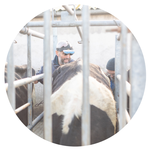
The cow is examined rectally, either by hand or using an ultrasound scanner.

You really need to know if a cow has held to a particular service, to plan for her future in the herd, whether that be a time to dry off/move to the calving pen, or to decide when to remove from the herd. It is also important not to cull heavily pregnant cows by mistake, as this will represent a simple loss of a calf and possibly another lactation, and often leads to involvement of trading standards due to the welfare implications of transporting and culling heavily pregnant cows. There is also plenty of evidence to show that each day a dairy cow is not in calf after 400 days of lactation, it costs between £2 and £4 in lost production. This can be effectively managed by having a well-thought out pregnancy diagnosis programme for each and every farm. Although it involves cost from the vet, it will yield significant savings and increased return from the stock already on farm.