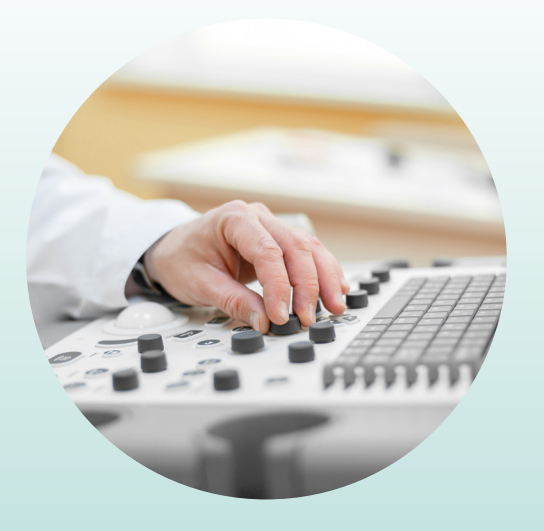
Ultrasound scanning of the uterus can easily detect pregnancy from 35 days post-service, and is very accurate up to 70 days.

So, what we would advise is presenting cows for examination from 5-12 weeks after service, with 6-8 weeks best for accuracy and taking action if shown not to be in calf. The cow is examined rectally, either by hand or using an ultrasound scanner, which is now the main method. Ultrasound scanning of the uterus can easily detect pregnancy from 35 days post-service, and is very accurate up to 70 days. After this time, it is often easier to use manual detection due to some of the constraints of scanners. When setting up a programme for PDs on farm, we would like to see fresh calved cows at about 3 weeks post calving, cows not seen bulling by a chosen date such as 50 days, and cows served for more than 30 days with no return to service. It helps if there is information available for each cow to tell the vet whether the cow has been calved, when it was last served and any issues since calving such as retained foetal membranes from calving.