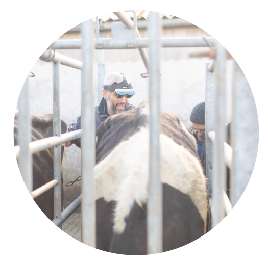
The cow is examined rectally, either by hand or using an ultrasound scanner.

You really need to know if a cow has held to a particular service, to plan for her future in the herd, whether that be a time to dry off/move to the calving pen, or to decide when to remove from the herd. It is also important not to cull heavily pregnant cows by mistake, as this will represent a simple loss of a calf and possibly another lactation, and often leads to involvement of trading standards due to the welfare implications of transporting and culling heavily pregnant cows. There is also plenty of evidence to show that each day a dairy cow is not in calf after 400 days of lactation, it costs between £2 and £4 in lost production. This can be effectively managed by having a well-thought out pregnancy diagnosis programme for each and every farm. Although it involves cost from the vet, it will yield significant savings and increased return from the stock already on farm.