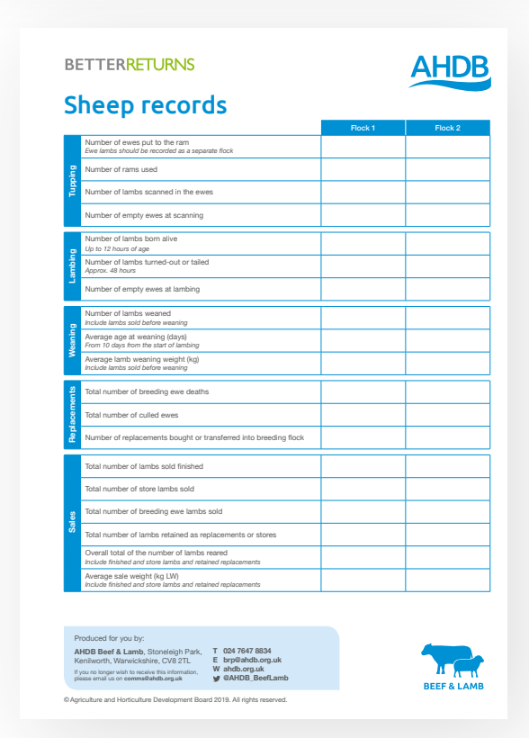
Sheep Records for Better Returns

Give us a ring and we will be more than happy to arrange a time to look over your KPIs with you and discuss how they can be used to improve your farm performance.