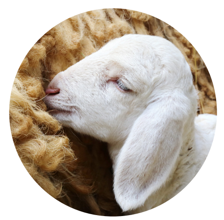
The virus may also be spread from ewe to lamb through milk or colostrum.

The Jaagsiekte retrovirus is spread through the air or direct contact with infected respiratory secretions and mucus. The virus may also be spread from ewe to lamb through milk or colostrum.