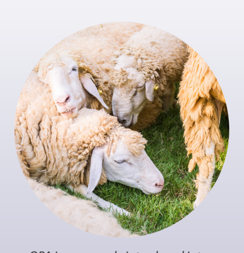
OPA is commonly introduced into new flocks through the purchase of new animals.

In affected flocks, OPA can be the cause of death of 1% to 20% of the flock in one year. Additional productivity losses such as reduced fertility have yet to be investigated. It is important to note here, that the early stages of OPA are not always apparent as the tumours are too small to cause any breathing problems, even though they are able to produce virus which can infect other sheep.