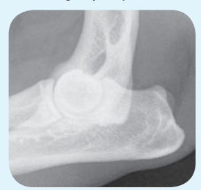
X-ray of a normal elbow joint

Radiography is commonly used to investigate joint problems.